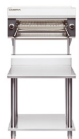
CS9 / C900-S